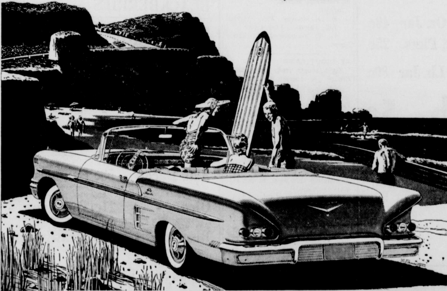
The Impala Convertible with Body by Fisher and Safety Plate Glass. • Air conditioning—temperatures made to order—for all-weather comfort. Get a demonstration!

See your local authorized Chevrolet dealer