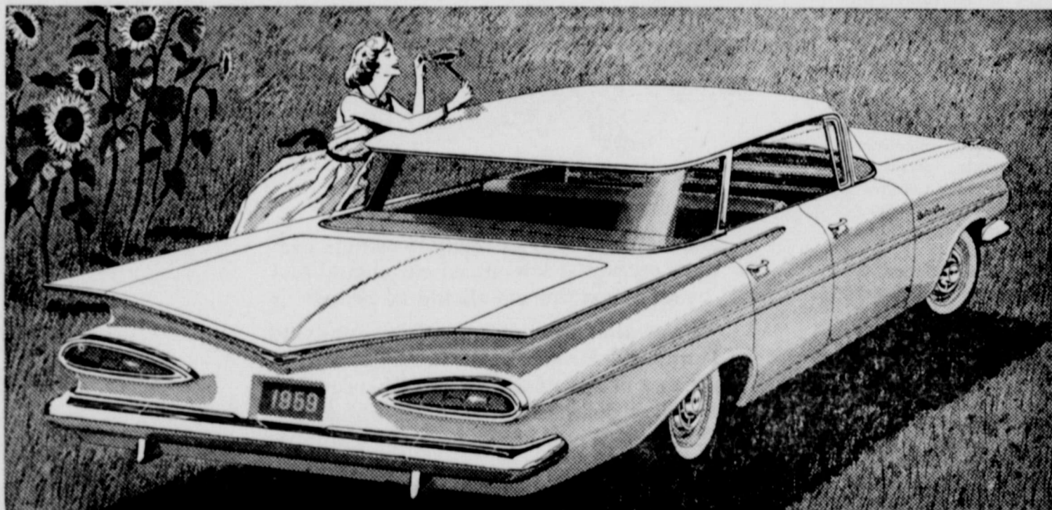
A new addition to Chevy's line—the beautiful Bel Air 4-Door Sport Sedan.

now—see the wider selection of models at your local authorized Chevrolet dealer's!