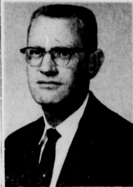
C. B. BARBEE

New sidewalks have been laid during the past week in front of Cactus Cafe and Sims Food.