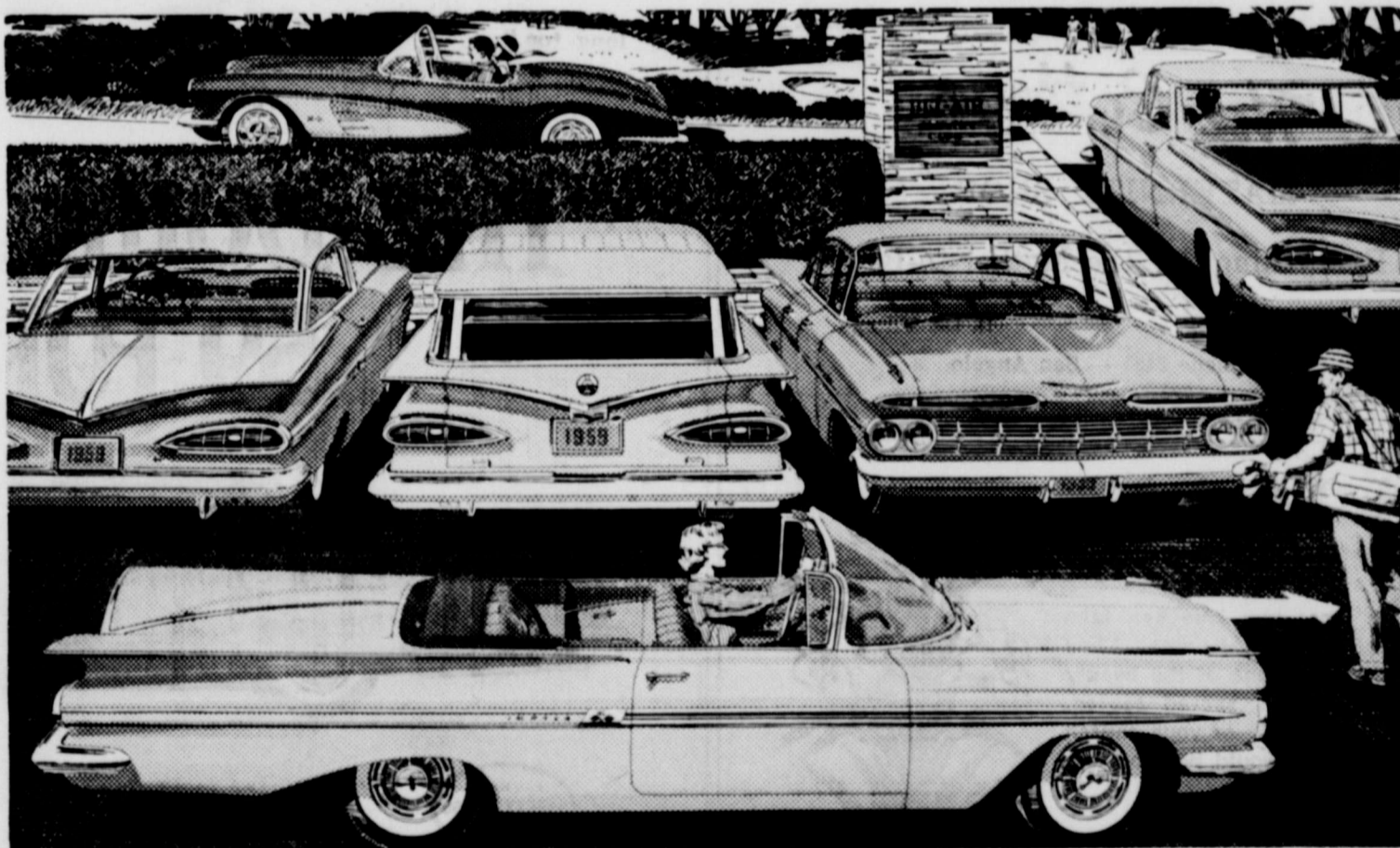
Your Chevrolet choice includes the Corvette, the Impala Sport Coupe, the Nomad Station Wagon, the Bel Air 4-Door Sedan, El Camino, and the Impala Convertible—all shown above.

now—see the wider selection of models at your local authorized Chevrolet dealer's!