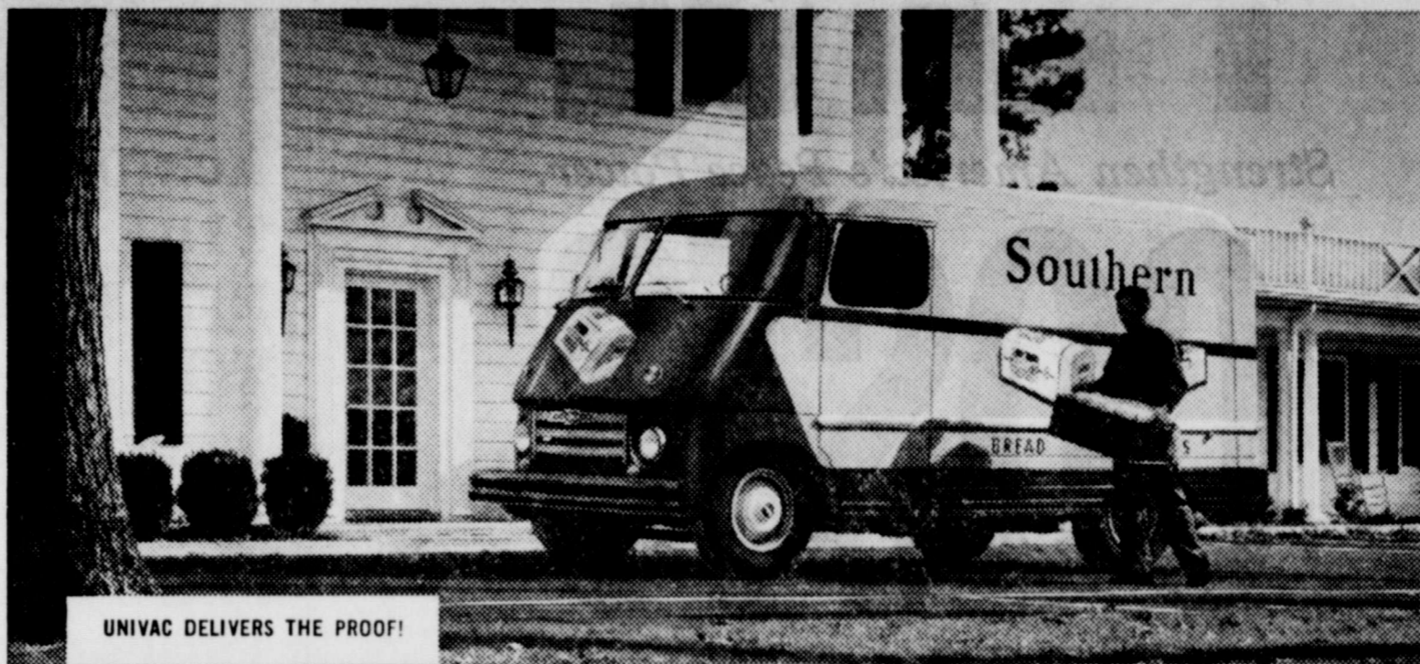
UNIVAC DELIVERS THE PROOF!