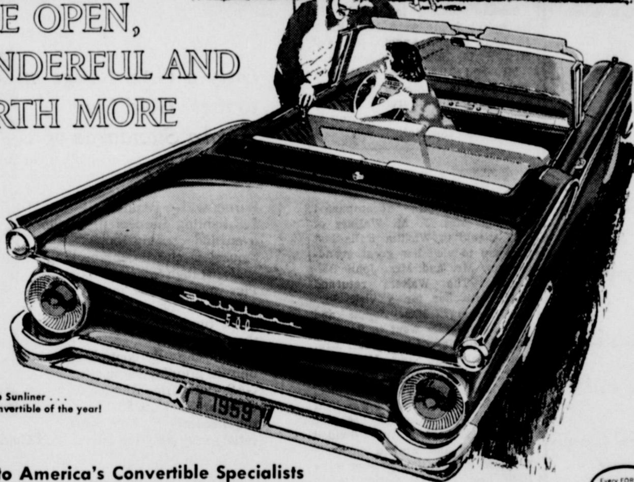
The Galaxie Sunliner . . . glamour convertible of the year!

Look to America's Convertible Specialists for sunshine living at its best!