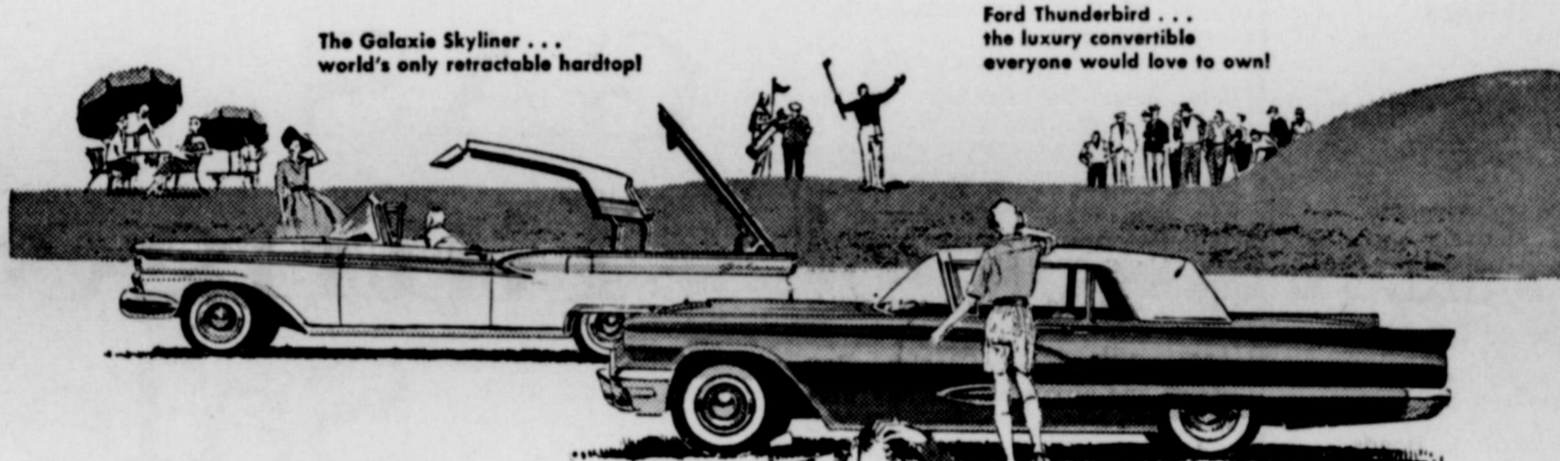
The Galaxie Skyliner . . . world's only retractable hardtop