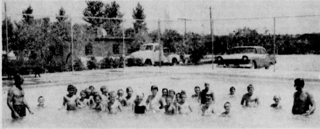
BLACKWELL SWIMMERS — Youngsters in the Blackwell summer recreation program and sponsors line up in the Bronte Pool to have their picture made. The youngsters are using the

local pool for the swimming portion of the recreation program.