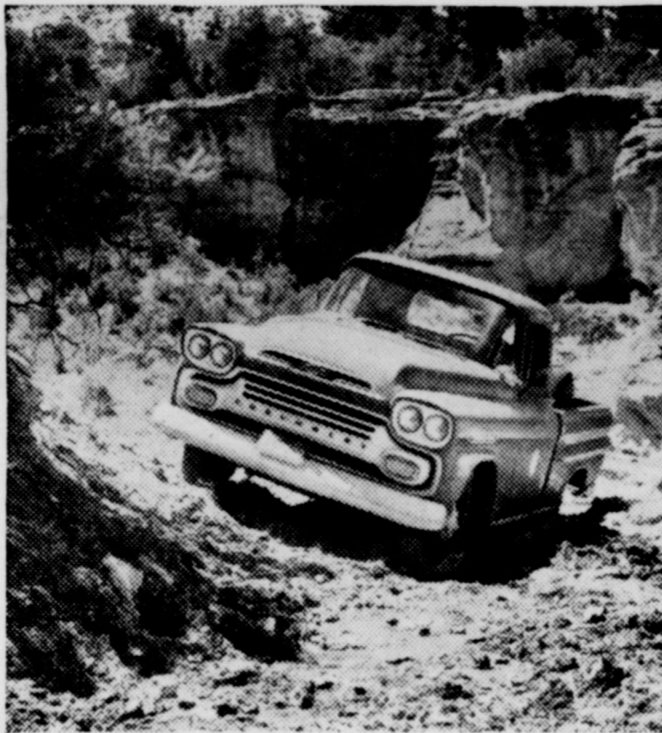
Up a steep mud-choked wash—Positraction pays off!

CENTRAL DRUG "Your Prescription Headquarters"