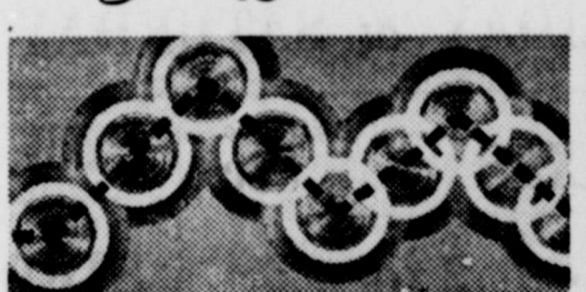
Ordinary tires "bounce" . . . multiply bumps and jars.

The new Atlas Bucron Tire grips the road so well you can't make it squeal. The secret is in the miracle new rubber of the tread.