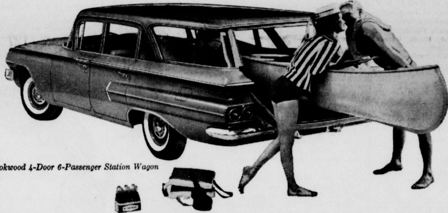
Brookwood 4-Door 6-Passenger Station Wagon

See The Dinah Shore Chevy Show in color Sundays, NBC-TV— the Pat Boone Chevy Showroom weekly, ABC-TV.