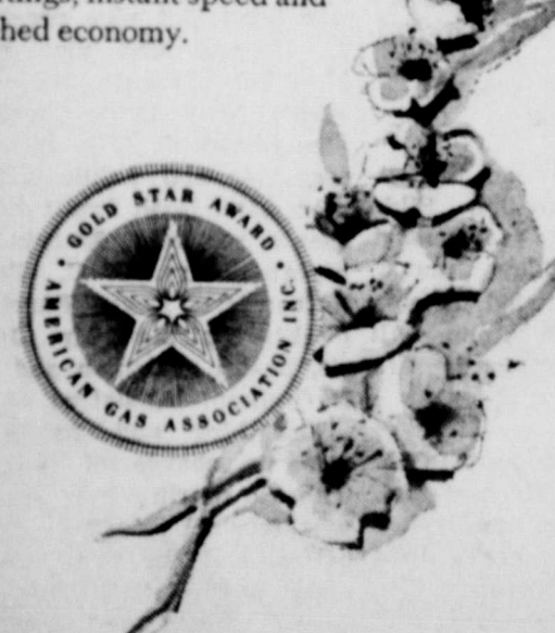
ANNUAL SPRING SALE OF GOLD STAR AWARD GAS RANGES AT GAS RANGE DEALERS and LONE STAR GAS

Enjoy the infinite control demanded by experienced cooks and professional chefs. Economical modern gas lets you control cooking for uniform perfect results. In your new, modern Gold Star gas range: automatic burner-with-a-brain, rotisserie, meat thermometer, thermostatic griddle. clock oven. Only with gas: no hangover heat, smokeless closed-door broiling, 1001 settings, instant speed and unmatched economy.