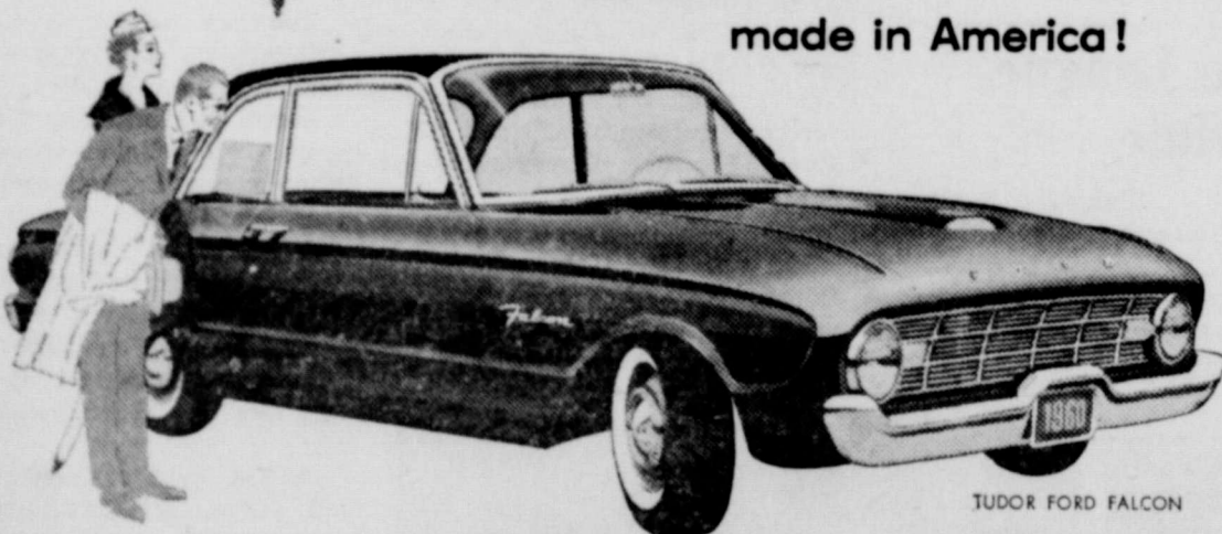
TUDOR FORD FALCON

It's a fact! Ford's advanced engineering makes the Falcon America's lowest-priced 6-passenger car . . . priced up to $124* less than other 6-passenger compact cars. That's not all. There's a quality difference in Falcon's big comfort, big doors, big luggage space! We invite you to fun-test the Falcon today!