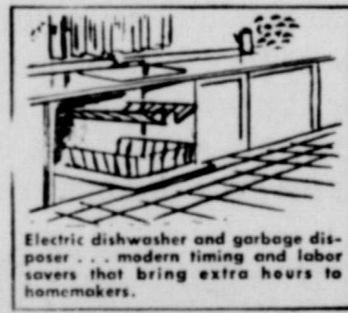
Electric dishwasher and garbage disposer... modern timing and labor savers that bring extra hours to homemakers.

COOL ..... Electric heat is transmitted directly to the pots and pans, and not out into the room. Your kitchen stays cool and comfortable... and so do you!