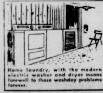
Home laundry, with the modern electric washer and dryer means farewell to those washday problems forever.

CONVENIENT .. Push a button or twirl a dial for automatic, carefree cooking, clothes washing and drying, dish cleaning and garbage disposing. It's as simple as that!