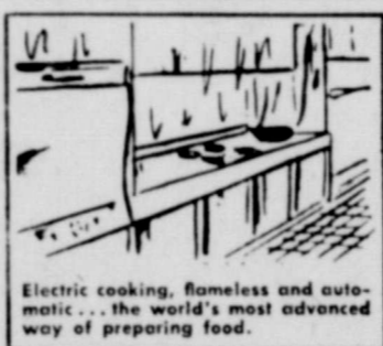
Electric cooking, flameless and automatic... the world's most advanced way of preparing food.