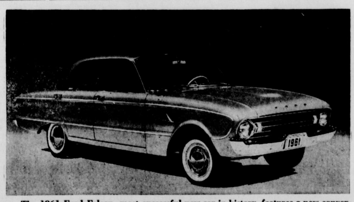
The 1961 Ford Falcon, most successful new car in history, features a new convexshaped aluminum grille and new optional, 101-horsepower engine, but preserves the styling, maneuverability, interior roominess and 23.7-cubic-foot luggage capacity of the 1960 model. Shown above is the 1961 Falcon Fordor Sedan. Continuing its proven economy reputation, the 1961 Falcon will deliver up to 30 miles per gallon on regular grade fuel, goes 4,000 miles between oil changes, and introduces new and longer lasting bright trim and underbody parts, including a double-wrapped aluminized muffler.

Arrott quick kicked as soon as play was resumed. The ball went into the end zone and was brought out to the 20. Good stops by Andrews and Luttrell held the Santa Anna lads to short yardage and an incomplete pass forced them to punt. The ball went out on Continued on Back Page