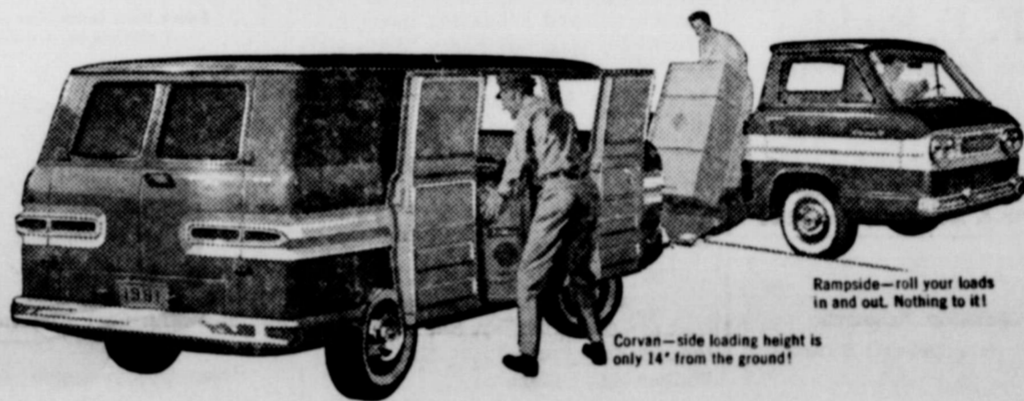
Rampside—roll your loads in and out. Nothing to it!