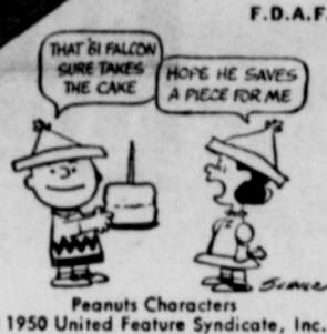
F.D.A.F. THAT'S FALCON SURE TAKES THE CAKE HOPE HE SAVES A PIECE FOR ME Peanuts Characters © 1950 United Feature Syndicate, Inc.

NO OTHER COMPACT MEASURES UP TO THE FALCON—WORLD'S MOST SUCCESSFUL NEW CAR. AT YOUR FORD DEALER'S!