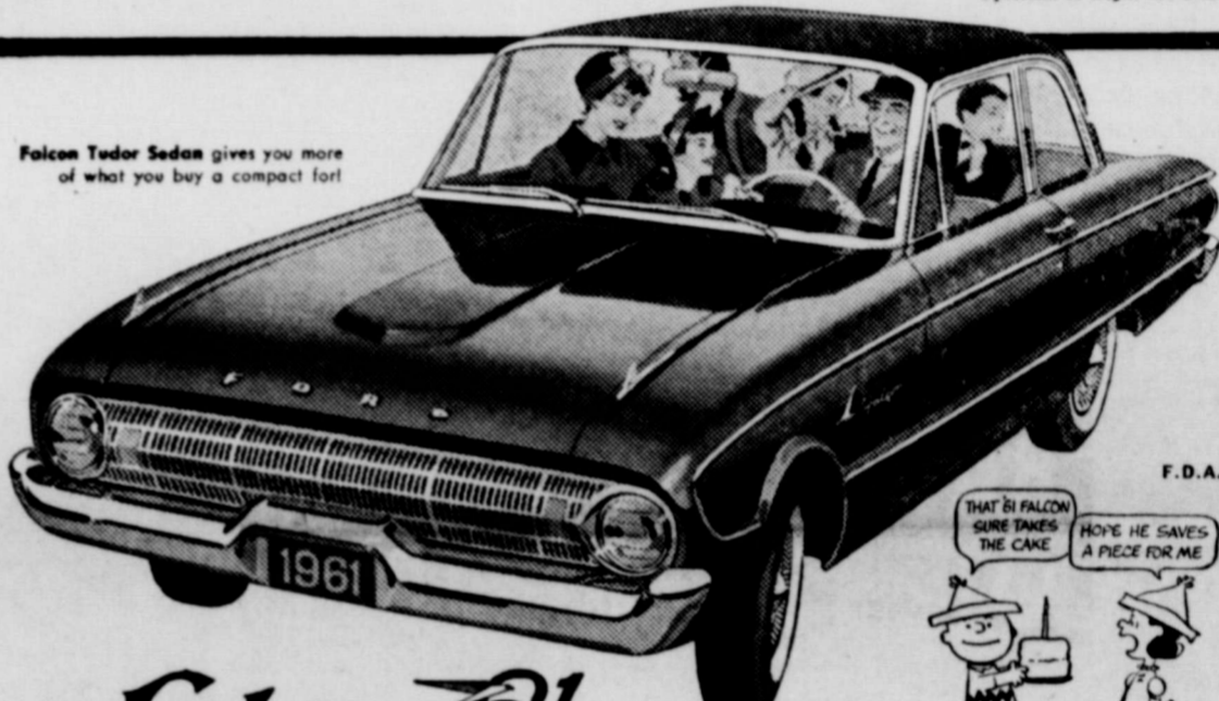
Falcon Tudor Sedan gives you more of what you buy a compact for!