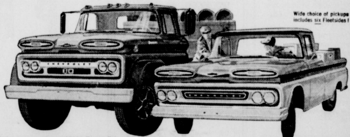
Wide choice of pickups includes six Fleetsides!