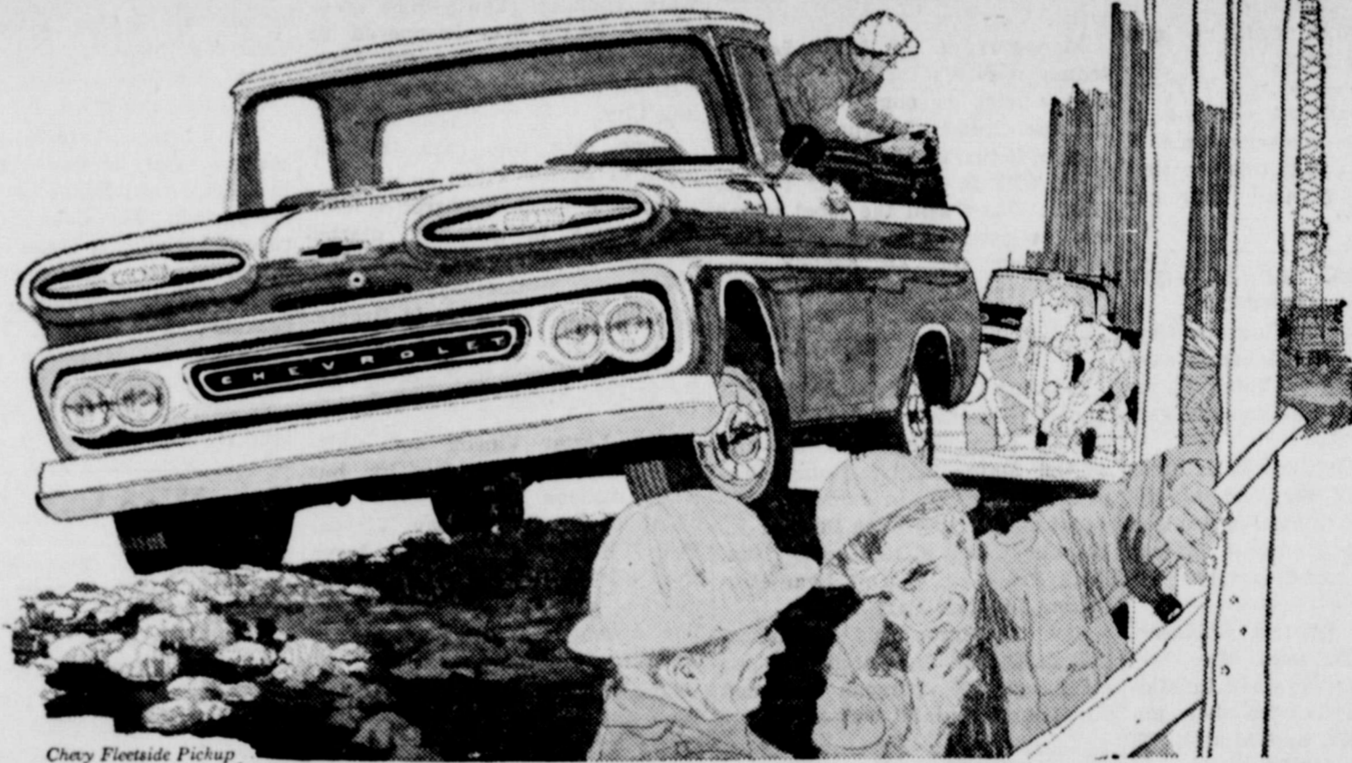
Chevy Fleetside Pickup

You'll get the best buy on the best selling brand at your Chevy dealer's Truck Roundup!