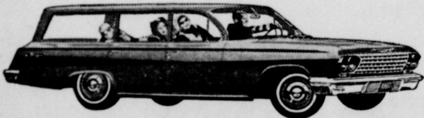
New Biscayne 4-Door 6-Passenger Station Wagon—lots of room and zoom