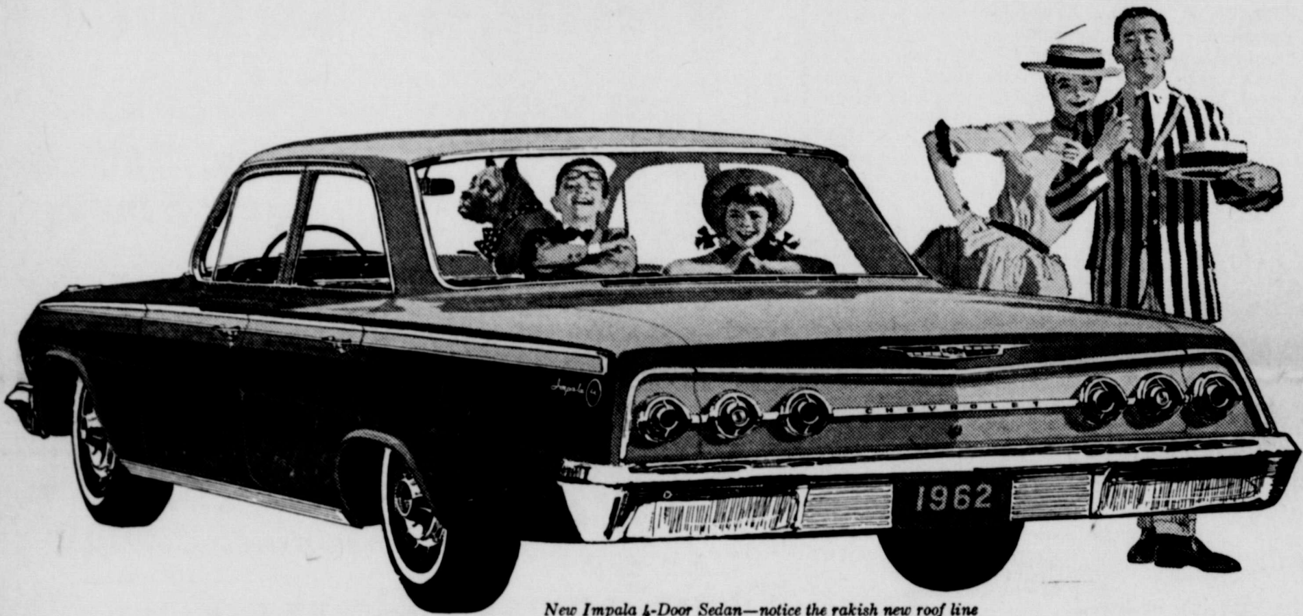
New Impala 4-Door Sedan—notice the rakish new roof line