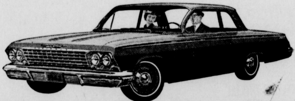
New Bel Air 2-Door Sedan—with beautifully crafted Body by Fisher

See the '62 Chevrolet, the new Chevy II and '62 Corvair at your local authorized Chevrolet dealer's