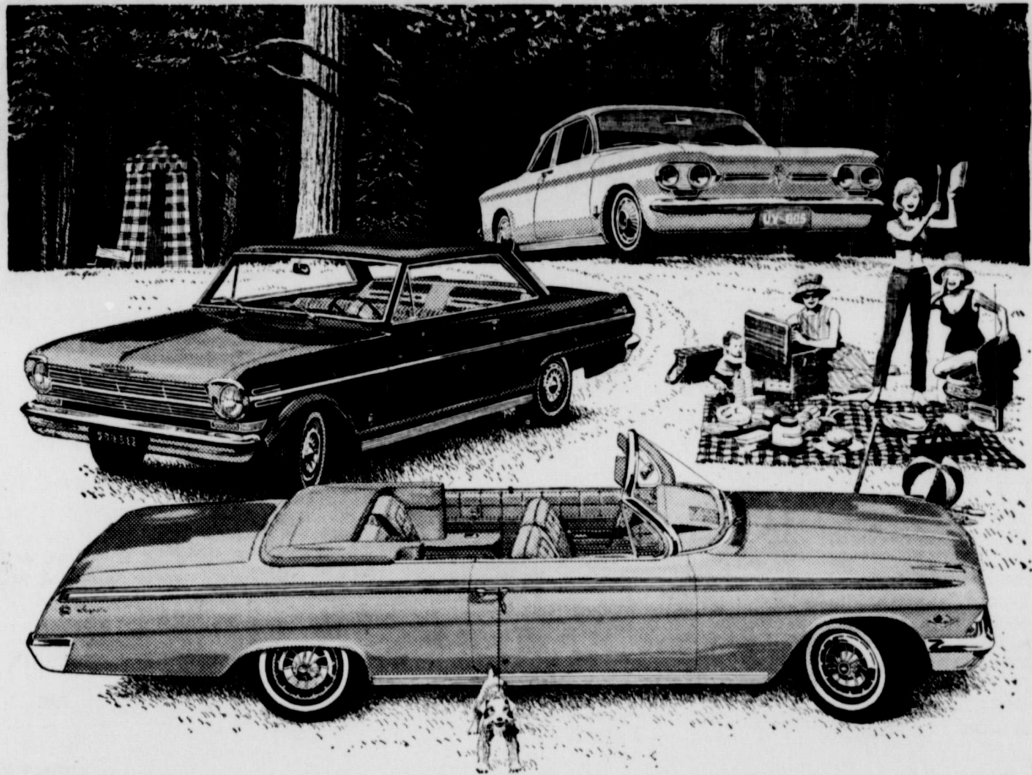
Top right—Corvaire Monza Club Coupe

YOU'LL FIND JUST THE CAR AT JUST THE PRICE AT YOUR CHEVROLET DEALER'S ONE-STOP SHOPPING CENTER!