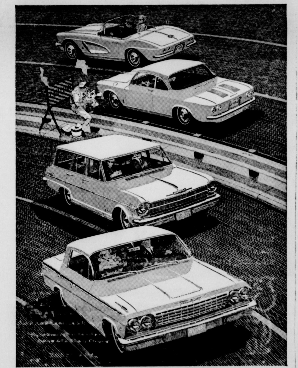
Four Sun 'n' Fun ways to get away (shown top to bottom) are the Corvette, Corvair Monza Coupe, Chevy II Nova Station Wagon and Chevrolet Impala Sport Sedan.

Now, beautiful buying days at your local authorized Chevrolet dealer's Golden Sales Jubilee!