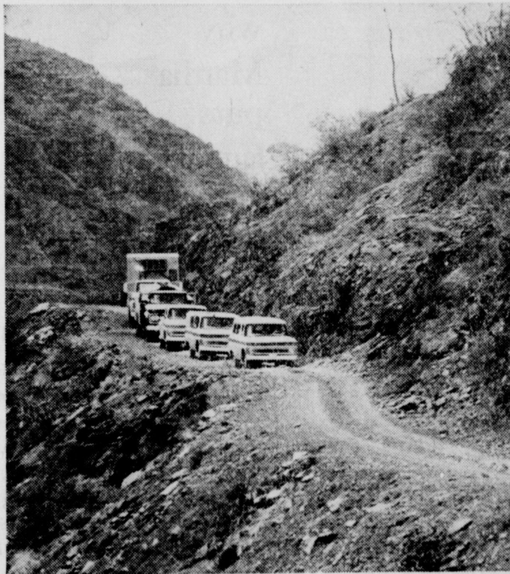
Sometimes the caravan crept along for hours in low gear. It took 17 days to go 1,066 miles! This is the road near Loreto.

...THE ONES THAT WHIPPED THE BAJA RUN...TOUGHEST UNDER THE SUN... TO SHOW THE WORTH OF NEW ENGINES, FRAMES AND SUSPENSIONS!