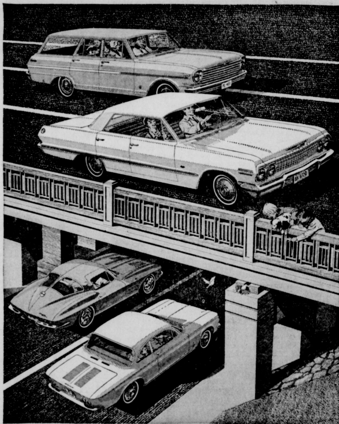
Shown (top to bottom), '63 Chevy II Nova 400 Station Wagon, Chevrolet Impala Sport Sedan, Corvette Sting Ray Sport Coupe and Corvair Monza Club Coupe

See four entirely different kinds of cars at your Chevrolet dealer's.