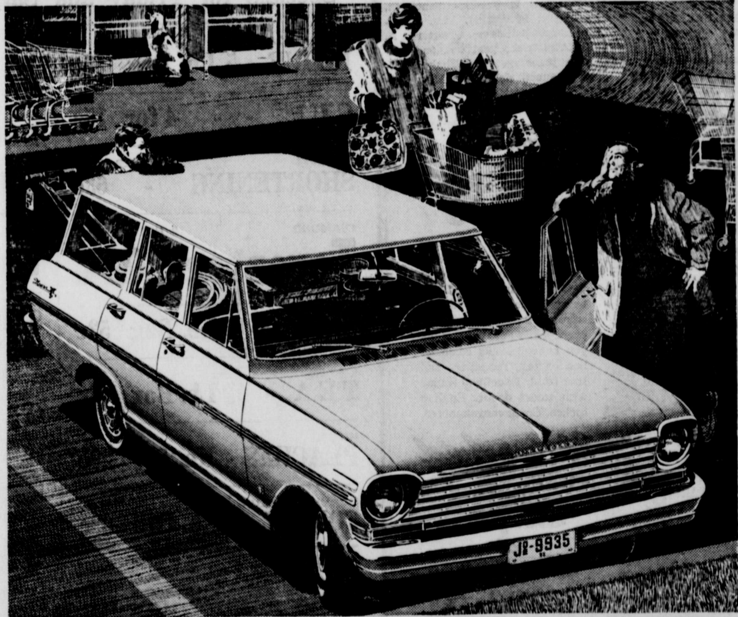
Nova 400 4-Door 6-Passenger Station Wagon

this one goes and goes on a gallon. They grow with brakes that adjust themselves. An exhaust system that lasts longer. And a Delcotron generator that keeps battery reserve power up. Want to hear more? How about a low price, natty interiors, Body by Fisher craftsmanship—and a talk with your Chevrolet dealer soon!