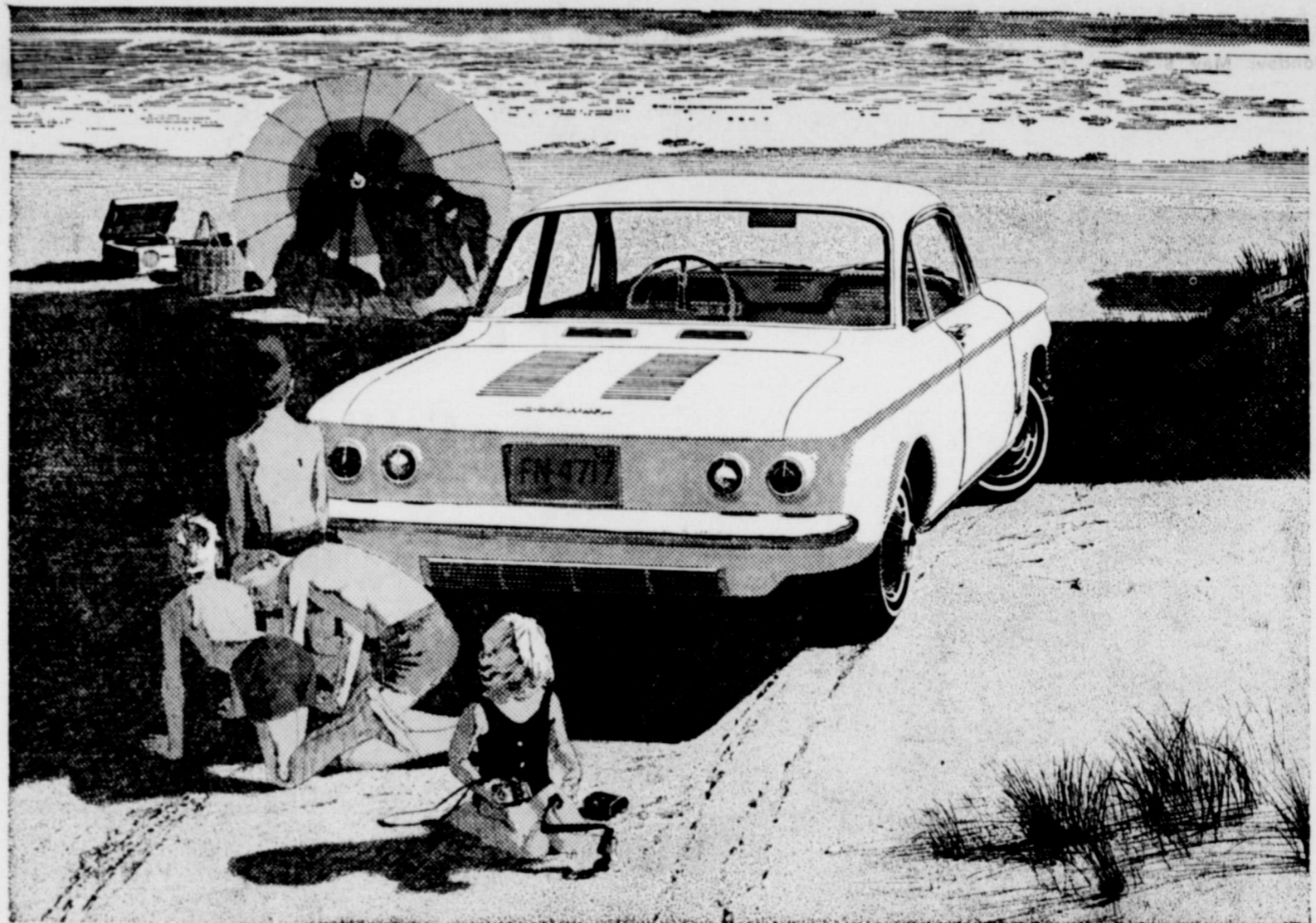
Corvair Monza Club Coupe