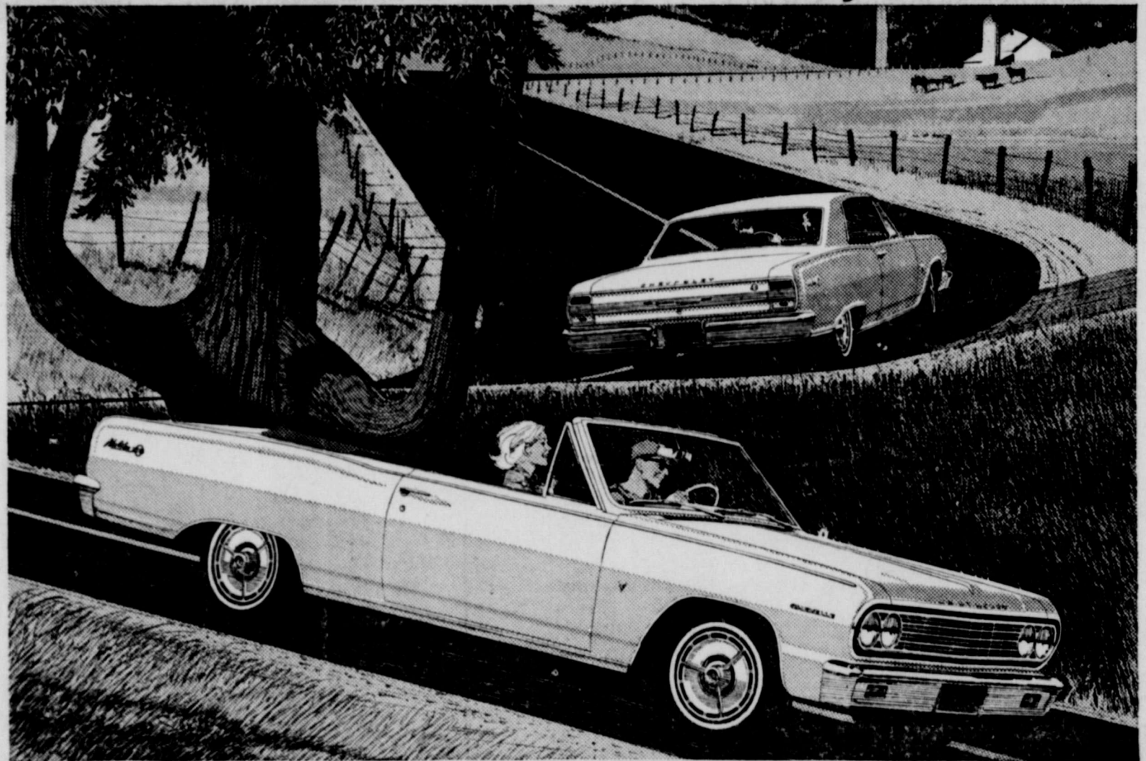
Background, new Chevelle Malibu Super Sport Coupe; foreground, Chevelle Malibu Super Sport Convertible.