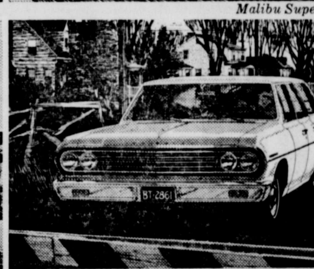
Malibu Super Sport Convertible