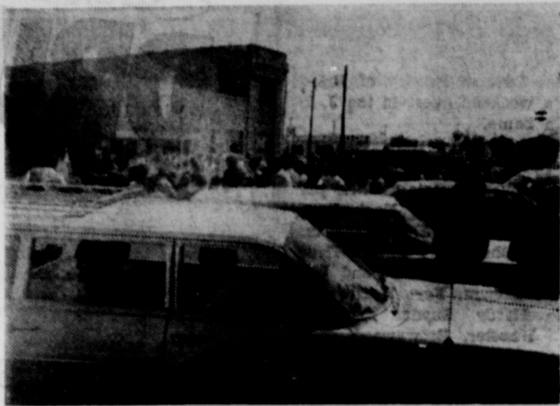
PART OF THE CROWD — A large group of students and local residents assembled in downtown Bronte last Wednesday to give recognition to students who have made notable achievement

during the spring season. A large number of students of students of both elementary and high school were recognized for their accomplishments in both literary and athletic activities.