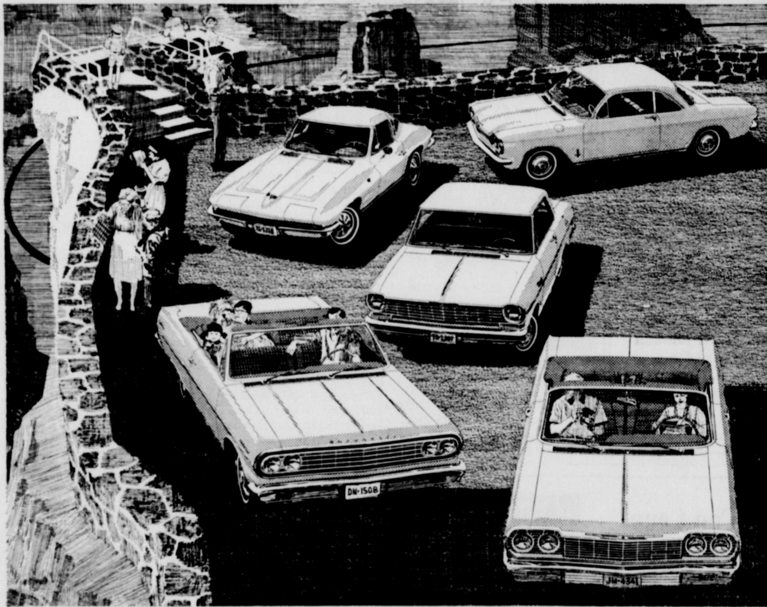
Models shown above: top left, Corvette Sting Ray Sport Coupe; right, Corvair Monza Club Coupe; center, Chevy II Nova Sport Coupe; bottom left, Chevelle Malibu; right, Chevrolet Impala.

Waited till now for that new Chevrolet? You've struck it rich, because right now it's "Trade 'N' Travel Time" at your Chevrolet dealer's.