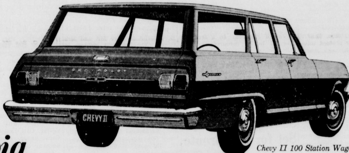
Chevy II 100 Station Wagon