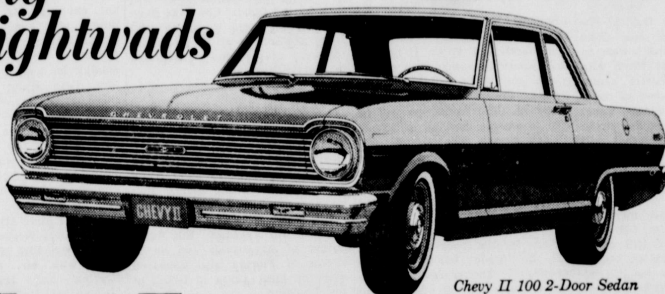
Chevy II 100 2-Door Sedan