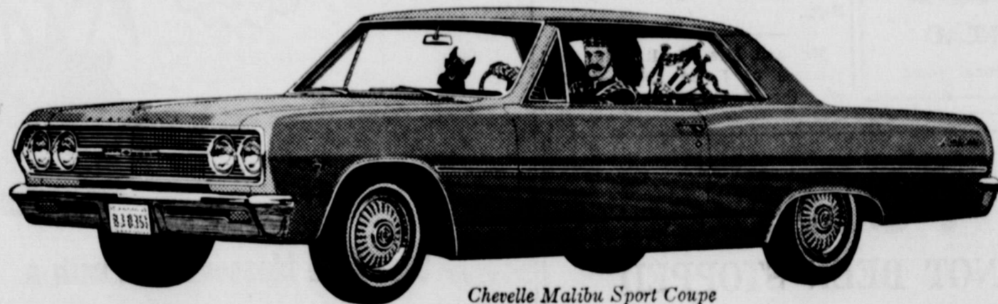
Chevelle Malibu Sport Coupe

No matter how you look at it, this car makes a lot of sense.