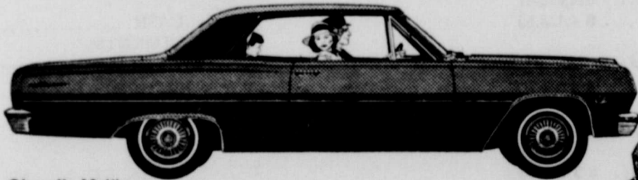
Chevelle Malibu Sport Coupe.

Now's the time to drive a great deal from a great choice of brand-new Corvairs, Chevrolets and Chevelles. Leave it to Chevrolet to make sure these beauties look costly. Leave it to your Chevrolet dealer to make sure they're not. But rush, rush, rush! They're moving out fast.