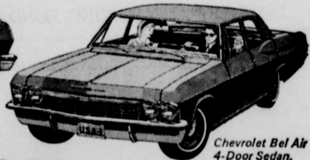
Chevrolet Bel Air 4-Door Sedan.

Now's the time to get a No. 1 buy on the No. 1 cars.