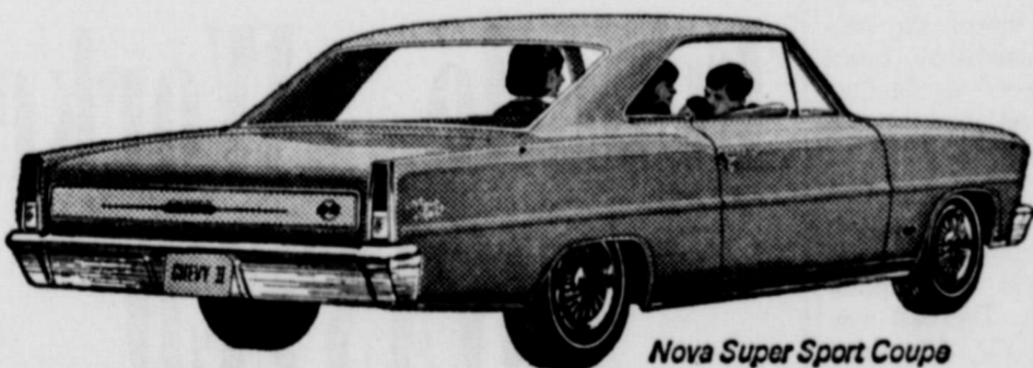
Nova Super Sport Coupe