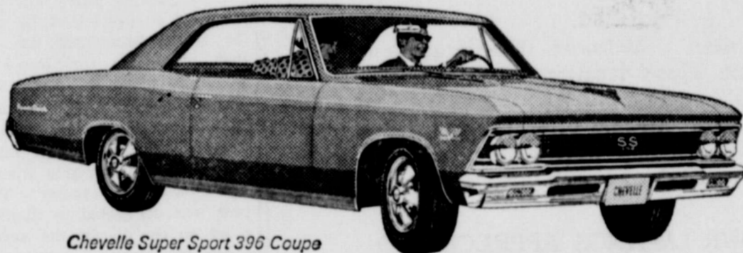
Chevelle Super Sport 396 Coupe

New 300's. New 300 Deluxe models. New Malibus. And two new Super Sport 396's—coupe and convertible—with engines that tell you exactly what kind of Chevelles they are. Both are available with 396-cu.-in. Turbo-Jet V8's, either 325 hp or 360 hp. And both come with special hood, grille, suspension, emblems, red stripe tires, floor-mounted shift. Twelve beautiful new Chevelles in all—and all as new inside as they are outside, headlamps to taillights.