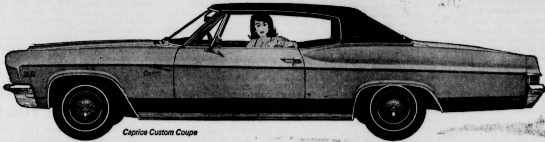
Caprice Custom Coupe