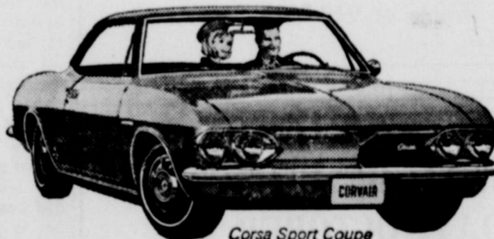
Corsa Sport Coupe