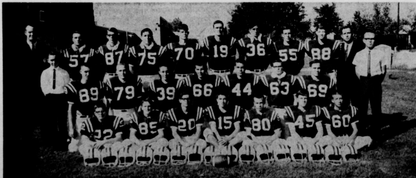
The 1965 Bronte Longhorns