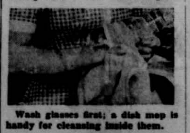
Wash glasses first; a dish mop is handy for cleaning inside them.

The easy way with dishes is the systematic way. Scrape, rinse and stack dishes in an orderly arrangement. Use 2 dishpans or 1 dishpan and drain basket unless you have a divided sink with stoppers. In one pan have hot, sudsy water. Keep boiling water at hand for rinsing.