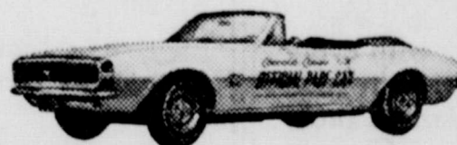
CAMARO CHOSEN 1967 INDIANAPOLIS 500 PACE CAR

Now, during the sale, the special hood stripe and floor-mounted shift for the 3-speed transmission are available at no extra cost! See your Chevrolet dealer now and save!