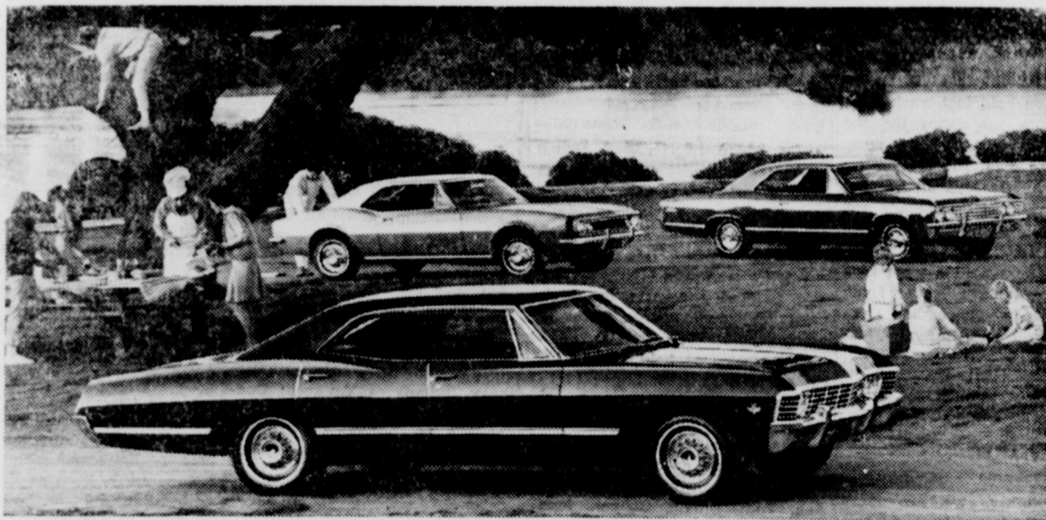
Foreground, Impala Sport Sedan. Background, Camaro Sport Coupe and the Chevelle Malibu Sport Coupe.

Drive the cost of living down, without giving up all this.