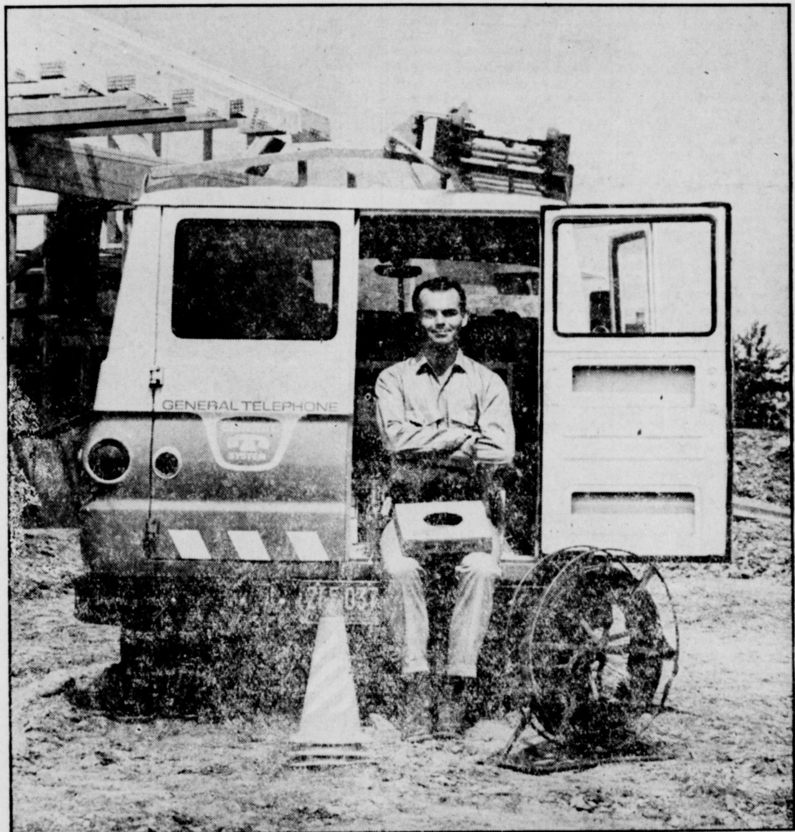
One of our busiest offices.

The man inside is a master of versatility. He's an installations expert, a crackerjack repairman, a walking catalog and an interior decorator.