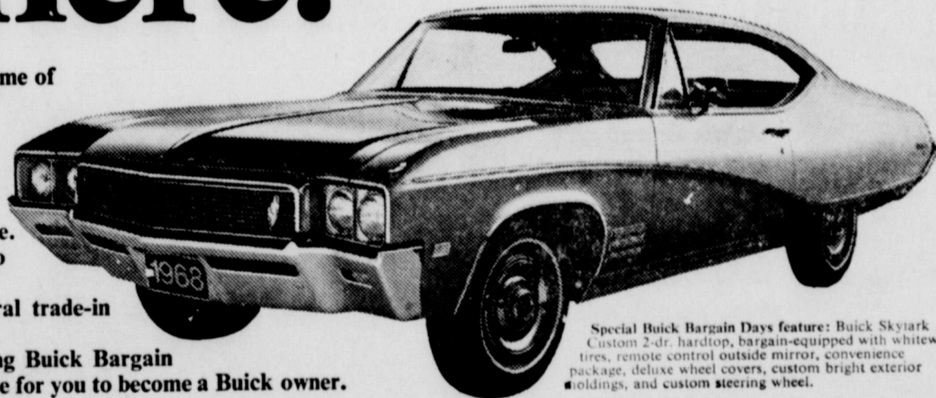
Special Buick Bargain Days feature: Buick Skylark Custom 2-dr. hardtop, bargain-equipped with whitewall tires, remote control outside mirror, convenience package, deluxe wheel covers, custom bright exterior moldings, and custom steering wheel.