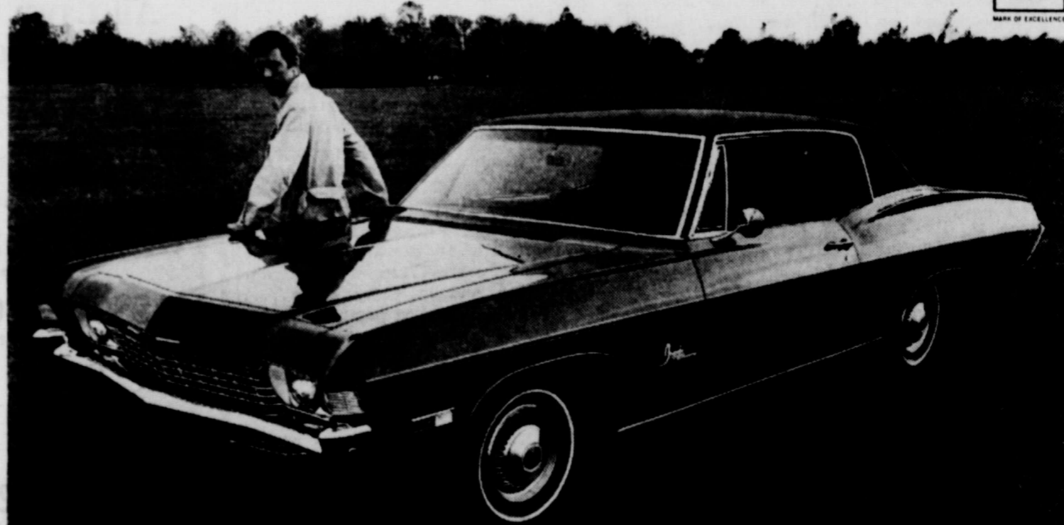
Impala Custom Coupe

Some cars are talking big price slashes. They know what they're worth.