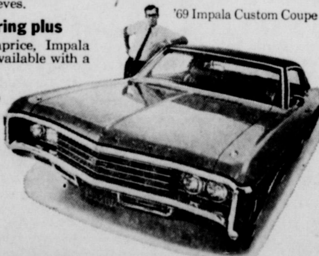
'69 Impala Custom Coupe

Walk into a wagon soon at your Chevrolet dealer's.