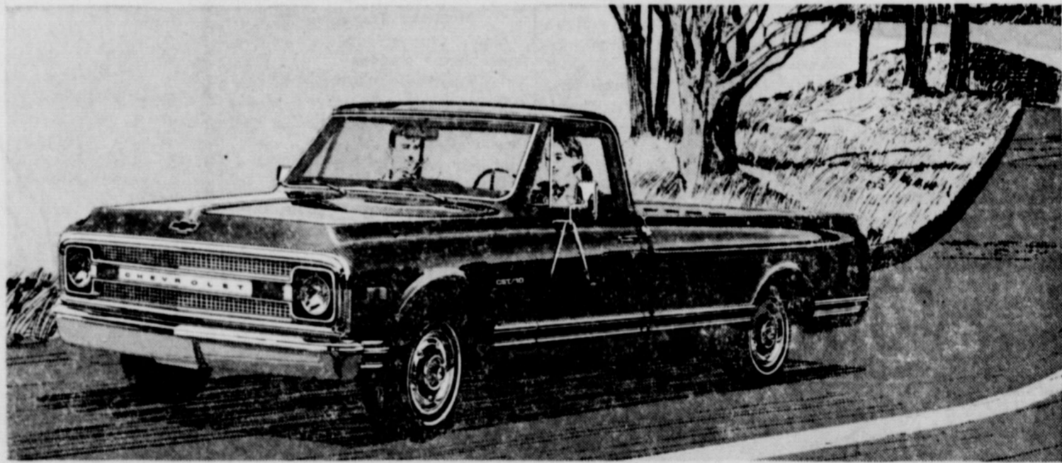
1/2-ton Fleetside pickup

Your first thought is that Chevy is a good looking pickup . . .