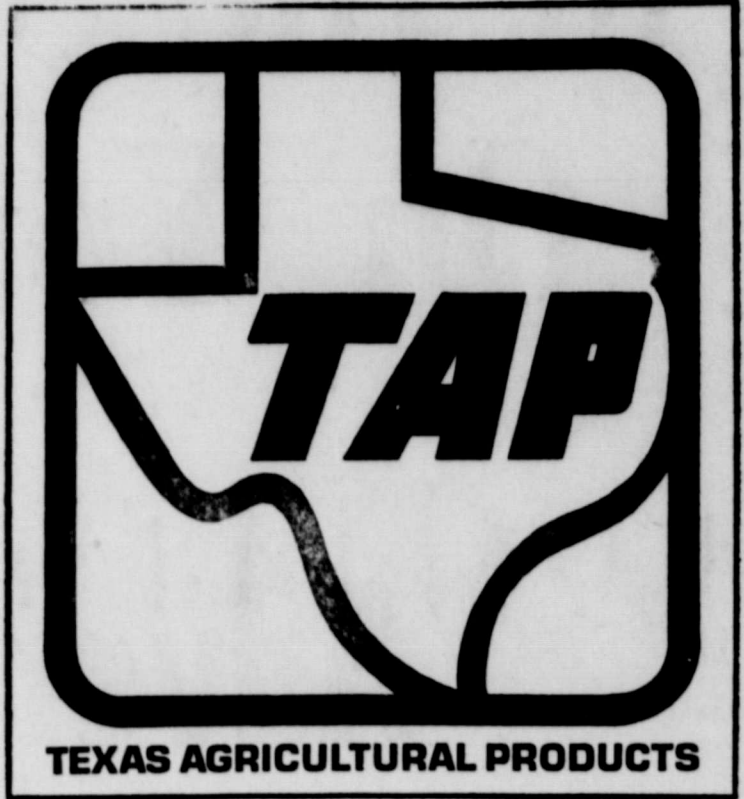
TEXAS AGRICULTURAL PRODUCTS

Bids are being checked by engineers before contracts are awarded. In the case of pumps, as much as a week may be required to ascertain the best bid after considering efficiency, etc.