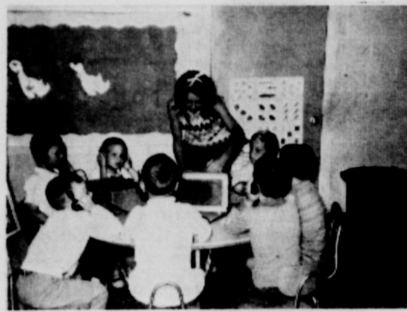
Youngsters Are Enthralled with Earphones