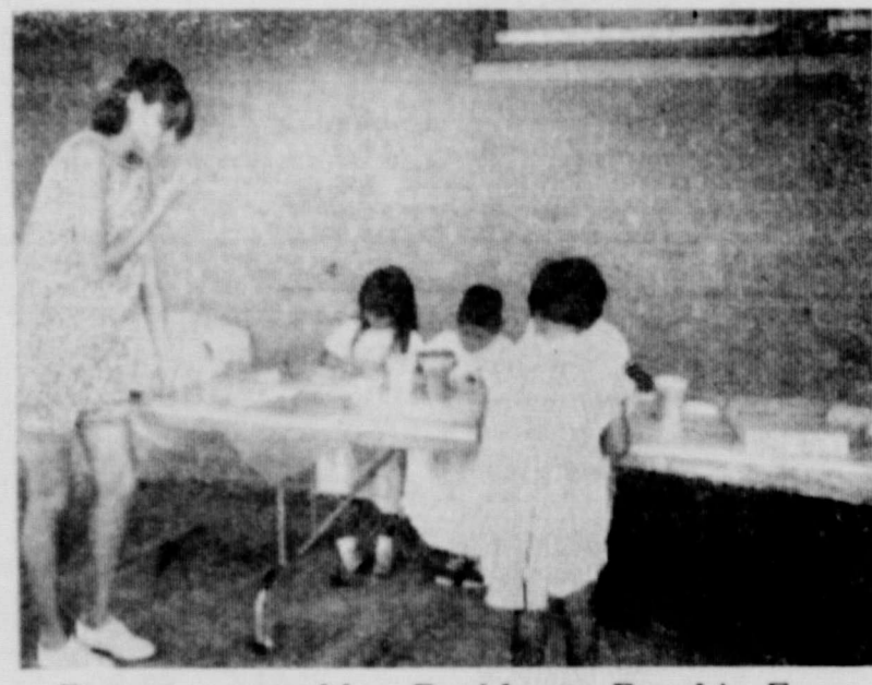
Fingerpainting May Be Messy, But It's Fun