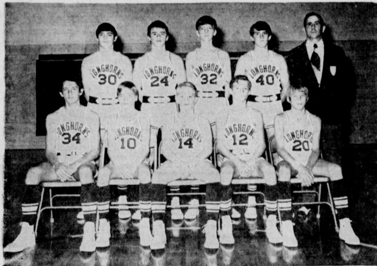
BOYS JV 8-4 —The boys junior varsity basketball has completed its 1973 season and wound up with eight wins and only