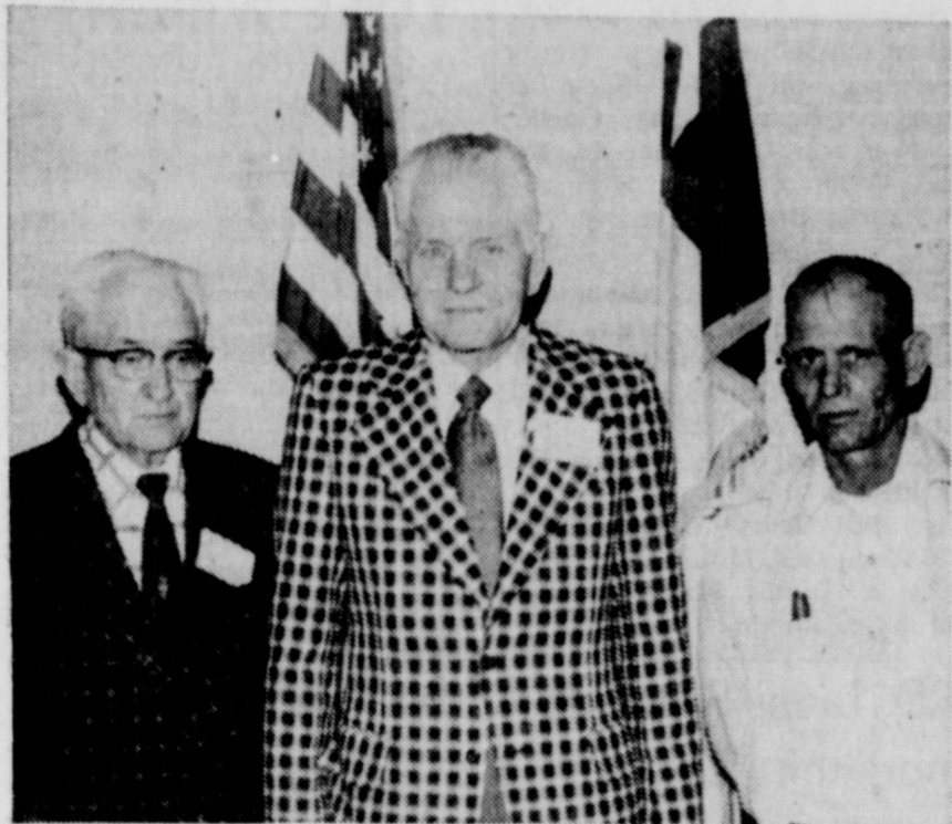
JUDGES AT SEMINAR — Three justices of the peace from Region IX were among the more than 50 judges who participated in a 20 hour basic Texas Justice of the Peace Training Center seminar conducted April 1-4 in Odessa.