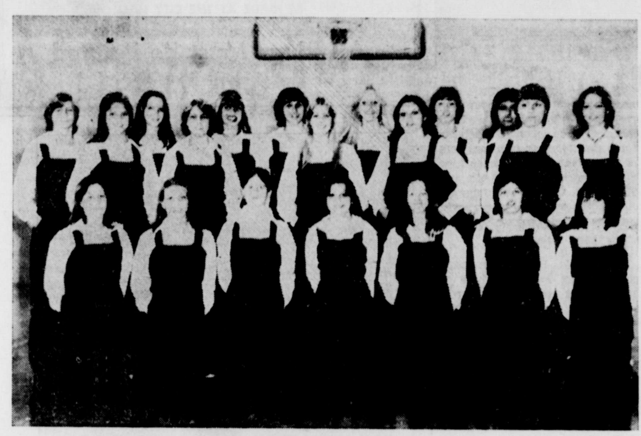
1976 DISTRICT 25-B CHAMPIONS