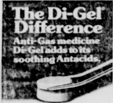
Di-Gel. The Anti-Gas Antacid.

A special invitation is issued by the Central Baptist Church to everyone in the area to come and worship with them each evening at 7:30 and on Sunday morning at 11 o'clock.