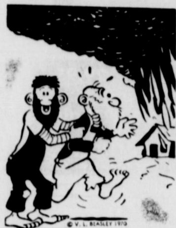
Granpaw Wants To Save His Fire Insurance Policy With