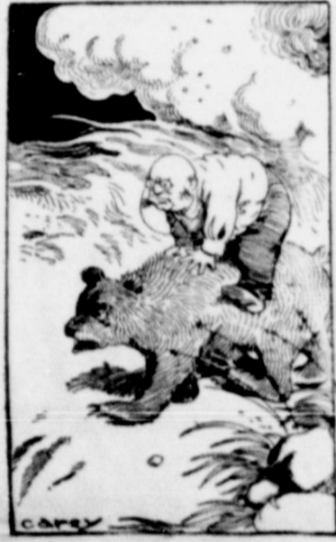
"HE CARRIED YOU TO SAFETY"

"Mr. Bowser," Mr. Bowser had read the evening paper and finished his cigar and was nodding in sleep when the voice of Mrs. Bowser as above, reached his drowsy ear and gave him a jump. "What is it he growled?" as he opened his eyes and scrambled around. "I want to talk with you." "Well, go ahead. You needn't scare a man half to death because you want to talk with him. I was dreaming that Dr. Cook and I were searching for the west pole out in Oregon." Mrs. Bowser looked at him for a minute, and then began: "Mr. Bowser, I want to know why you exaggerate the way you do. It is getting to be something shameful, and it has got to stop?" "What do you mean, woman?" he exclaimed as he suddenly roused up. "I will tell you what I mean, sir. One evening about six weeks ago our minister and his wife called. During the conversation he mentioned that a friend of his passed through the fire in the north woods of Canada two or three years ago. He said that his friend saw two black bears with their fur afire. You remember don't you?" "Yes, I remember." "And you at once turned around and said that while you and a companion were out in the Rocky mountains hunt-