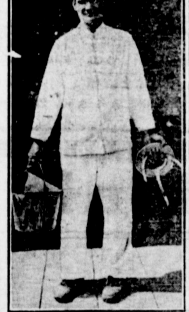
A SANITARY MILKING SUIT.

The first milk and cream contest was held in 1904 during the national dairy show in Chicago. Since then