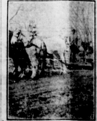
DRAINAGE AN EARTH ROAD. money furnished the community to get

[Prepared by office of public roads.] That full value may be received for the money appropriated for road purposes and that the best results obtainable may be secured it is essential that the right man shall be placed in charge of road work. He should be selected not only because he actually knows more about road work than any other person in the community, but also because he can get the best results from the money furnished. It is not sufficient, however, to let the matter rest with the appointment of a road overseer. He should receive the whole-hearted support of the community in the work. It should be seen that under the conditions and with the