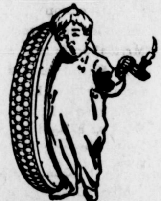
Time to Re-tire? (Buy Fisk)