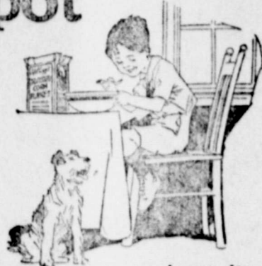
"Bobbie dog, guess it makes you hungry, too. To see me eat a great big bowl of Kellogg's for breakfast every morning! But I can't spare any today, Bobbie; honest I can't!"

You can't resist the appeal of Kellogg's Corn Flakes! Pour out a bowl brim full of Kellogg's—big, joyously brown, crisp and crunchy! Was there ever such an appetite treat! And, such a flavor! A breakfast or lunch or supper thrill for big folks as well as little ones.