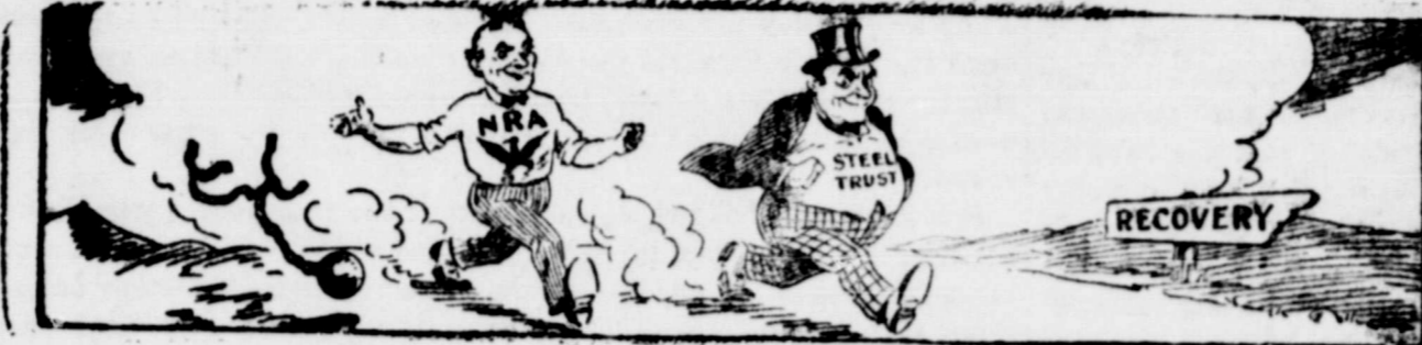
Suspended the anti-trust laws and ended competition;