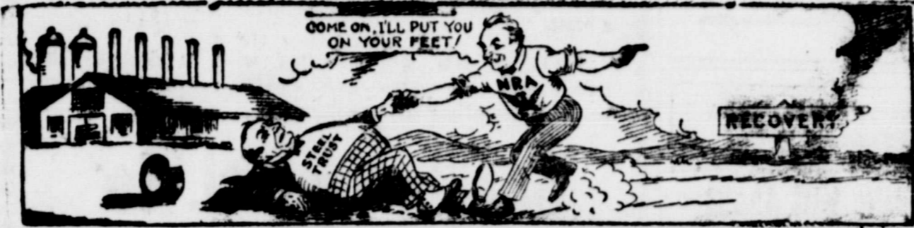
After the NRA put the Steel Industry back on its feet;