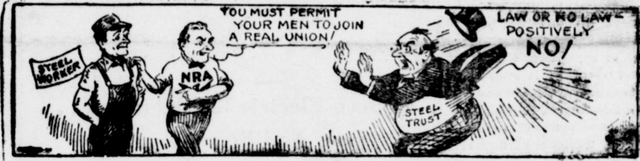
The Steel Industry now insists its workers must not have the right to organize!