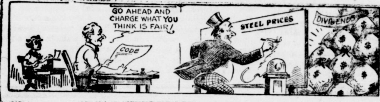
Allowed price-fixing with generous profits.