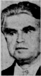
John L. Lewis

YOU'VE got to hand it to John L. Lewis. The beetle-browed leader of the C. I. O. is going places and doing things, despite several setbacks in his plans to unionize all industry. The steel magnates are yielding to a great extent, and the threat of a general strike in that industry is fading out. With the Carnegie-Illinois corporation, largest subsidiary of United States Steel, leading the way, the biggest concerns in that industry are granting increases in wages and the 40 hour week, and agreeing to deal with the unions affiliated with the C. I. O. This is the first time in 45 years that "Big Steel" has recognized union labor as a bargaining agency for its employees.