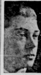
Duke of Windsor