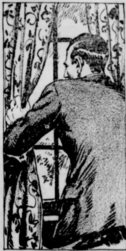
His Eyes Peering Cautiously Into the Garden.

"Do you mean," Professor Garden interrupted, "that intercommunicating buzzer between here and