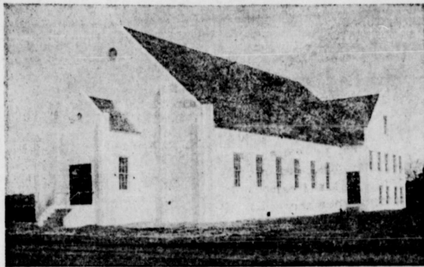
NEW ROBERT LEE BAPTIST CHURCH BUILDING

Formal dedication of the new Robert Lee Baptist church and homecoming of the members and former pastors Sunday, was attended by approximately 400, some of whom came a distance of 300 miles. Those attending included members of denominations in Robert Lee and Baptists from Abilene, Sweetwater, Bronte, San Angelo, and surrounding rural communities.