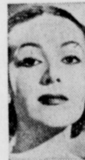
Dolores Del Rio

Dolores Del Rio returned home with glowing tales of her vacation trip to Morocco, and a lot of souvenirs—perfume, jewelry, necklaces. Leaving Africa, she flew across Spain, and on to Paris, where she saw a lot of old friends and acquired a lot of new clothes.